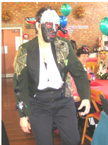
Count Hole in the Heart Dracula