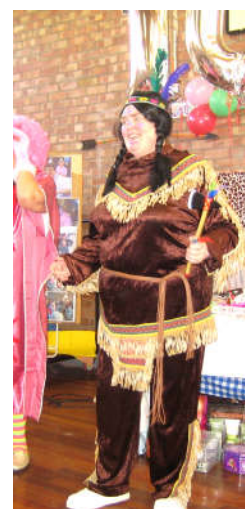
Hoy ya Hammer ower here Hinney