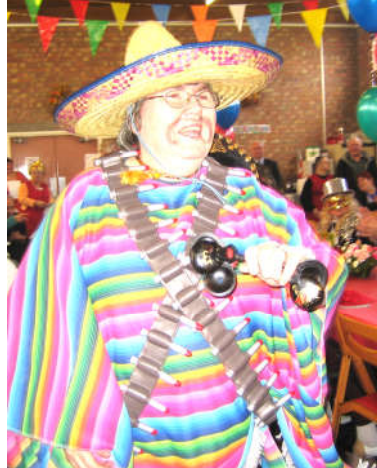
Red Hot Cactus Willie