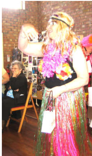
Bloody Coconut Mary