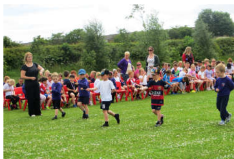
The above photographs are Our Lady & St. Joseph's Primary School (Brooms)

On Monday, 29 th June, 2015 Leadgate Primary School and Our Lady & St. Joseph's Primary School (Brooms) held their annual sport day. The weather was brilliant and both events were well attended. Above are photographs taken by your roving reporter who attended both functions (lack of space stops the printing of more photographs).