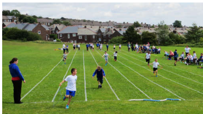
The above photographs are Leadgate Primary School