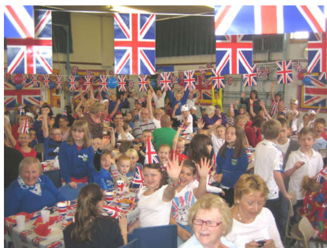
Some of the children and guests