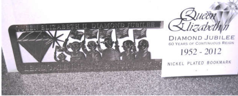
This is a photograph of the book mark the children were presented with