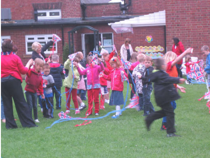
Some of the children flying their kites