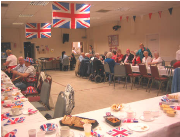
Some of those attending the 'street party'

On Thursday, 31 st May, 2012 Derwentside Homes held a 'Jubilee Street Party' for its residents and families in the Community Centre.