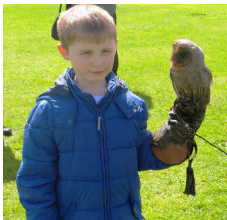
This little boy is holding one of the birds of prey – a kestrel