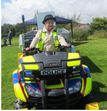
This is yours truly sitting astride the police quad bike

It wasn't just the youngsters who enjoyed themselves and here are the photographs to prove it: