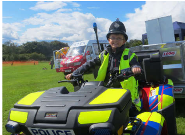
This little boy perhaps has decided early in his life, he wants to be a policeman – he is sitting astride the police quad bike