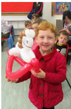
This little girl won the balloon for guessing it was a rocking horse