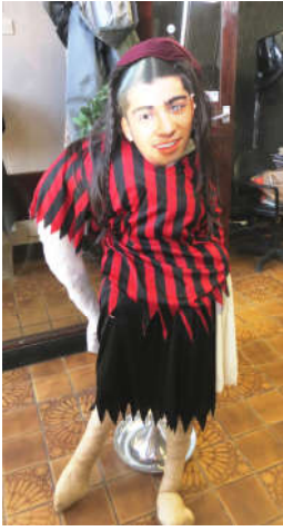
Billy the Pirate (Salon 19)