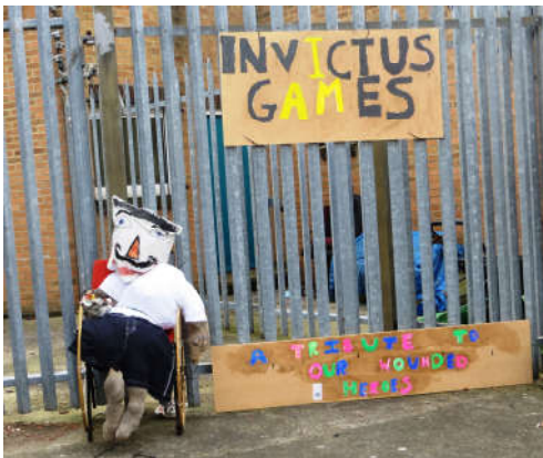
I am Invictus (tribute to wounded soldiers)

Our village's Fifth Scarecrow Festival started on 27 th September, 2014 and to those who participated I should like to give a vote of thanks for the time and effort spent devising and making their individual scarecrows. Unfortunately, the entrants this year were somewhat reduced - instead of rising each year our participants diminish. Your roving reporter has been out and about and here are the pictures to prove it.