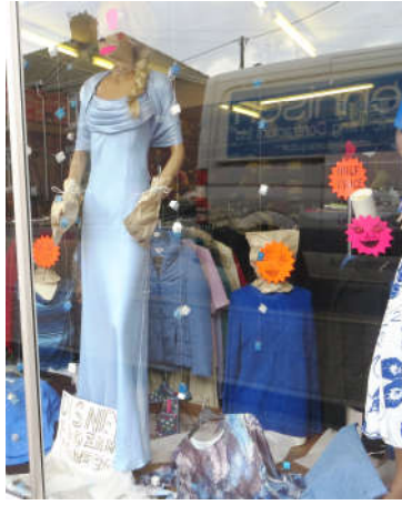
Disney's 'Frozen' (Davison's)