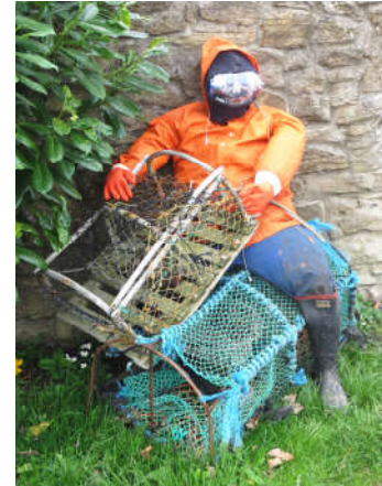
Mending my nets