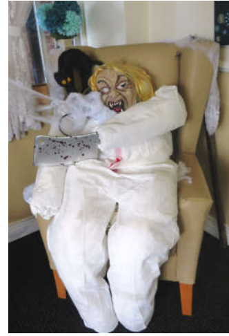
Scary Mary (Redwell Hills Care Home)

Leadgate has various shops but each year only two participate and they are Salon 19 and Davison's. I know Davison's isn't very clear, but that's the best I could do when taking the photograph from outside the shop. This year Redwell Hills Care Home took part in the Festival with 'Scary Mary'. As the Partnership say each year, this isn't a competition, it doesn't matter how good or bad the scarecrow is, it is just for fun.