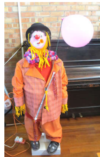
Cocoa the Clown