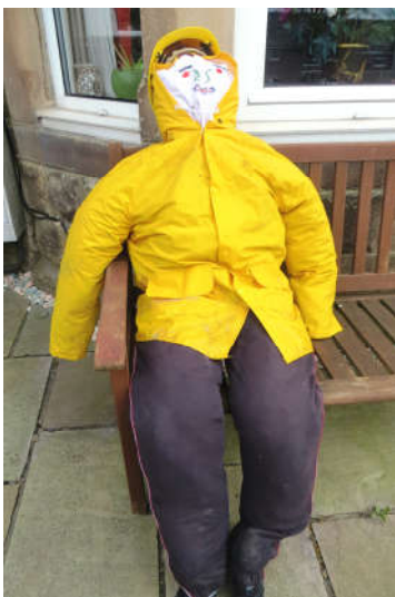
Ready for any weather