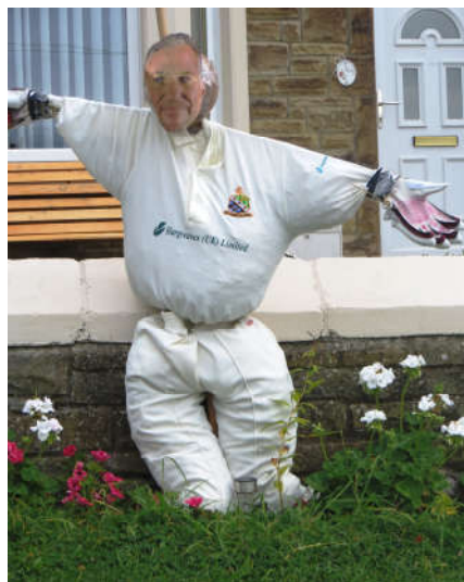
Ian Botham look-alike