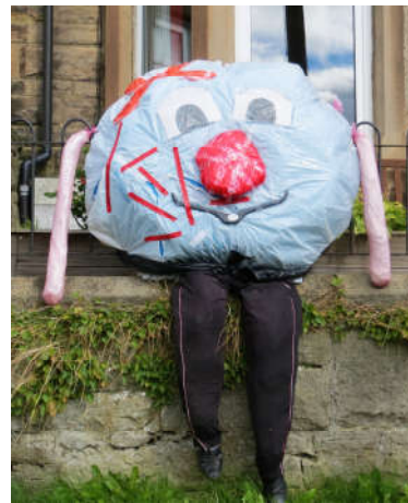
Humpty Dumpty has been put back together