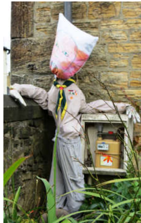
Mr Scout Master