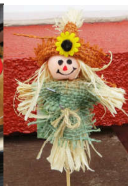
The Mini Degrees