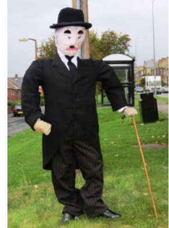
Mr. Charlie Chaplin