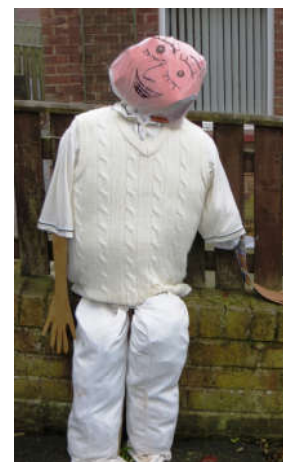
Ian Botham lookalike