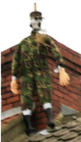
If I told you my name I would have to kill you