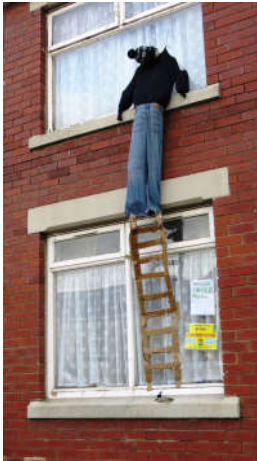
The window cleaner

The Partnership held its 4 th Scarecrow Festival between 21 st September and 5 th October, 2013 and here are pictures of the entries. As you know, it isn't a competition, it's just for fun and to those people who took the time to make scarecrows the Partnership would like to say a very big THANK YOU.