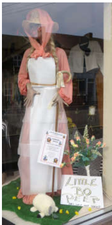
The Bo Peep Twins