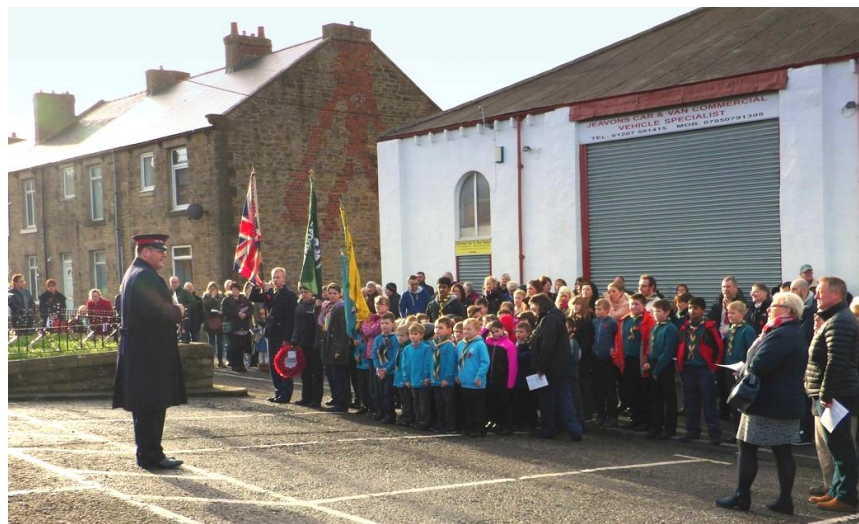
Photograph of some of the people who attended the Remembrance Day Services