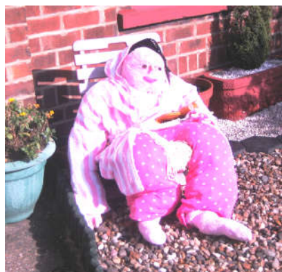
Miss Leadgate Rag Doll, 2012