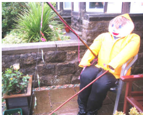
Hoping to catch something for tea