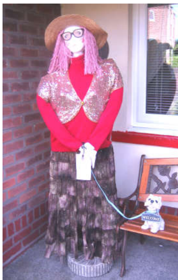
Mrs. Woman and her little dog Having a rest before I start again