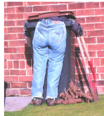
I'm sure it's in here somewhere

The pitman having a rest (picture No. 3) was eventually thrown onto the road - he was so realistic I was told someone called an ambulance. To all those who participated the Partnership would like to offer their sincere thanks and hope, if we have the festival next year, they will not be put off by the weather or the vandals. People are now starting to comment and to enjoy our village's little bit of fun.