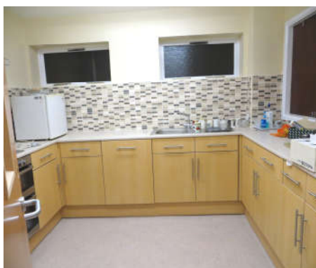
This is how it looks after refurbishment