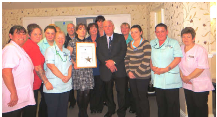
Councillors, Home Manager and members of staff