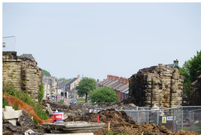
Now you don't

Work on the demolition of our infamous Leadgate Bridge commenced on 25 th May, 2016 and within 10 days it was down, who would have thought once down you would be able to see nearly all of Front Street from the Villa Real side, well above right is the proof, when I took the photograph I found it hard to believe how much I could see.