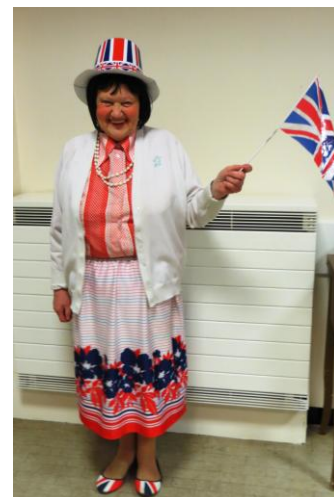
Lady who won hat contest