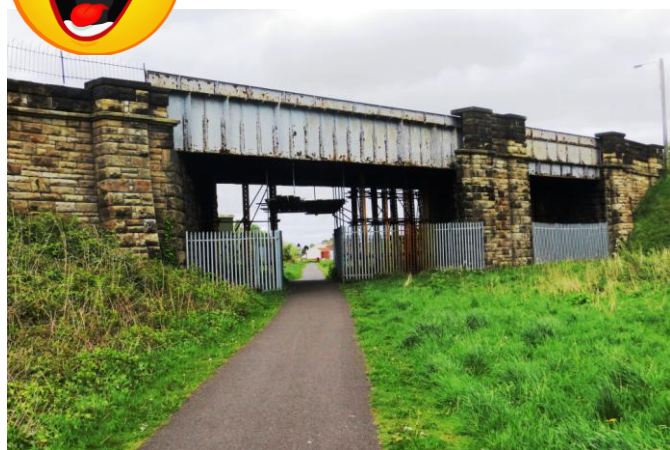
Now you see it

Did we ever think this day would come, well here's the proof, and it's a case of now you see it, now you don't